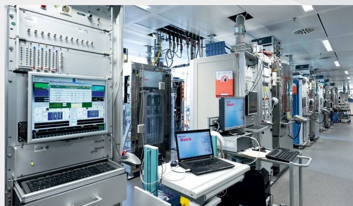
High-tech laboratory continuous-operation test benches