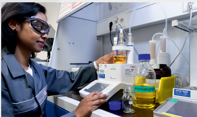
ESI6 is subject to chemical testing in the development center laboratory.

ESI6 brake fluid has been subject to intense testing of both system pressure build-up and wear and noise at extreme temperatures.