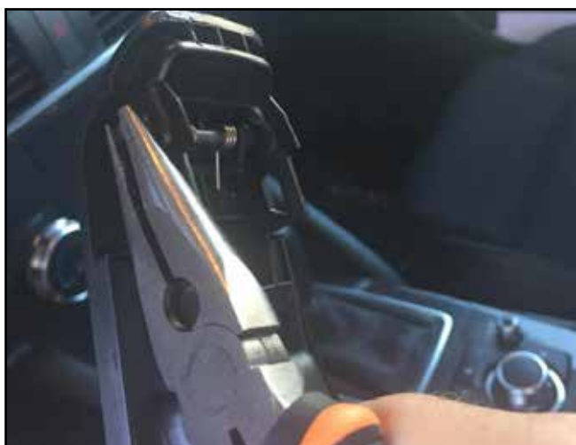
Pulling the knurled end.