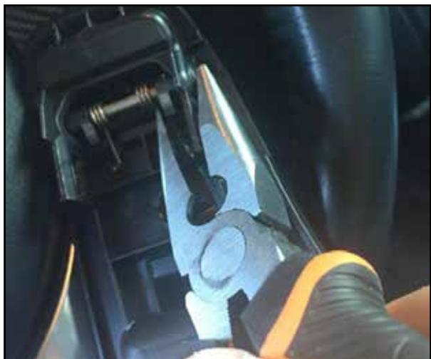
Pushing the pointy end.