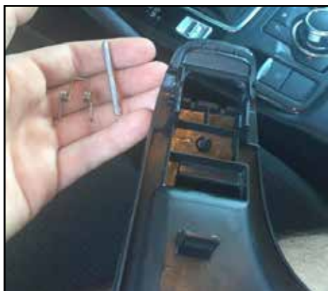
The spring and rod.