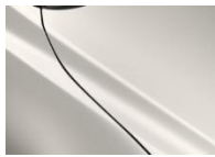
Crystal White Pearl (34K)