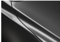
Meteor Grey Mica (42A)