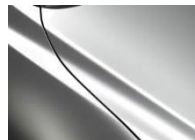
Sonic Silver Mica (45P)