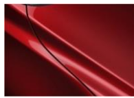
Soul Red Mica (41V)