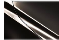
Titanium Flash Mica (42S)