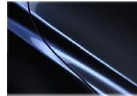
Deep Crystal Blue Mica (42M)